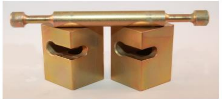
The 911 Pin-Lock Too™ incorporates two blocks and one double pin.